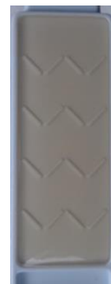
After 3 months with 75% less biocide (under 1,000 CFU)

Slight raise in CFU count as HydroFLOW began to remove biofilm from the cooling tower