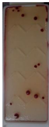
After 1.5 months with 50% less biocide (between 1,000 to 5,000 CFU)

Biocide chemicals kept CFU levels at a minimum