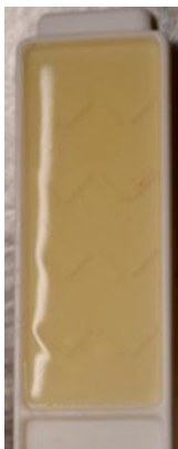
Baseline measurement with 100% biocide (under 1,000 CFU)

Total bacteria count in the tower's recirculating water: