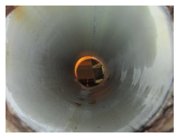
May 24, 2011