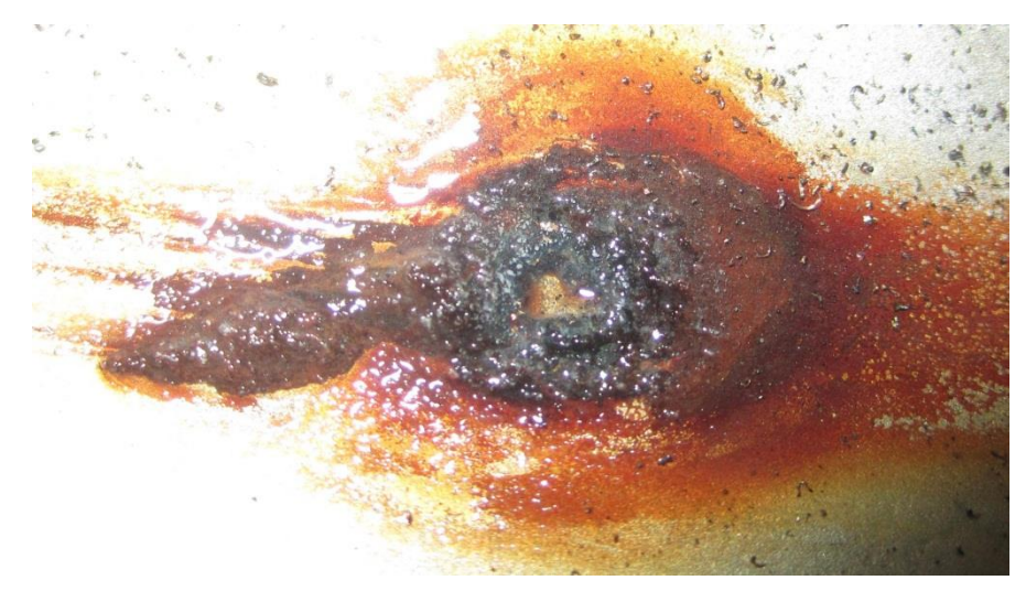
March 28, 2011