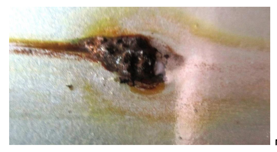
May 24, 2011