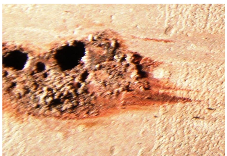
July 12, 2011