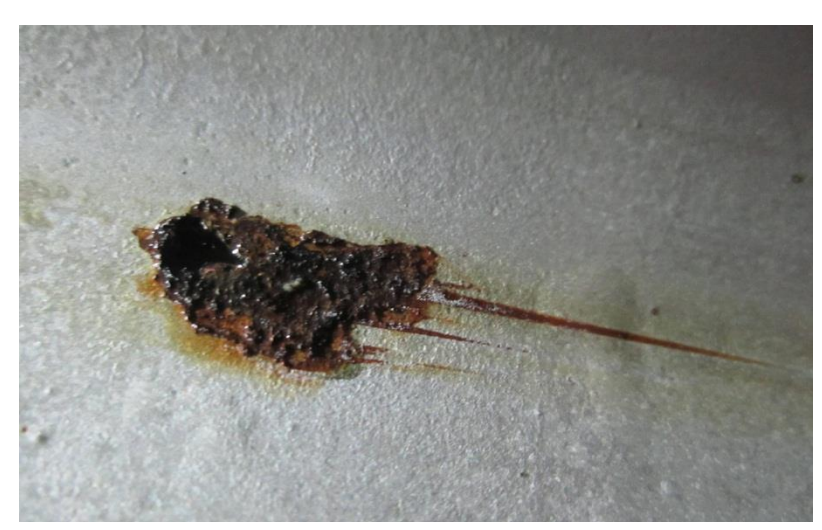
May 24, 2011