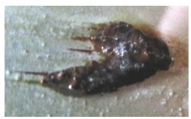
May 24, 2011