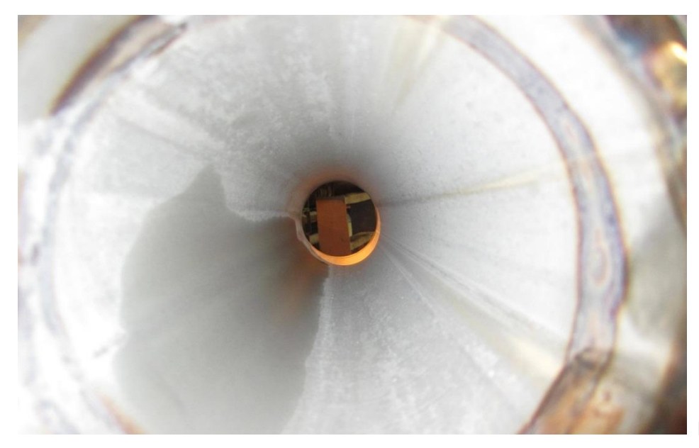
May 24, 2011 (after 8 weeks)