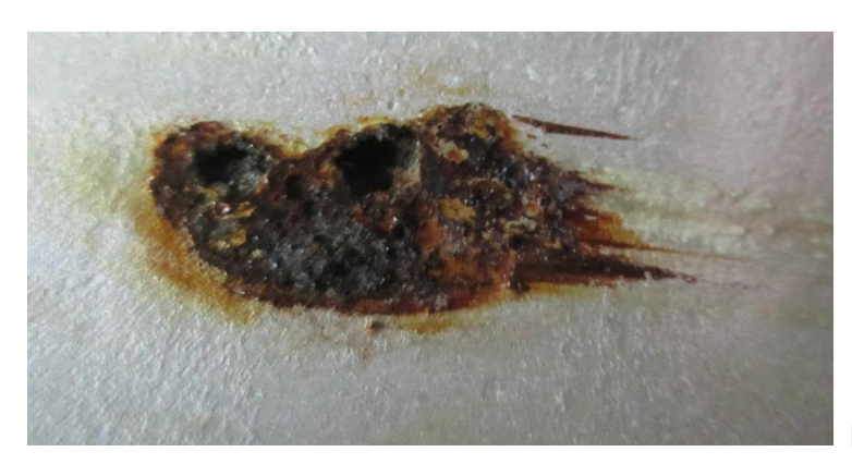
March 28, 2011