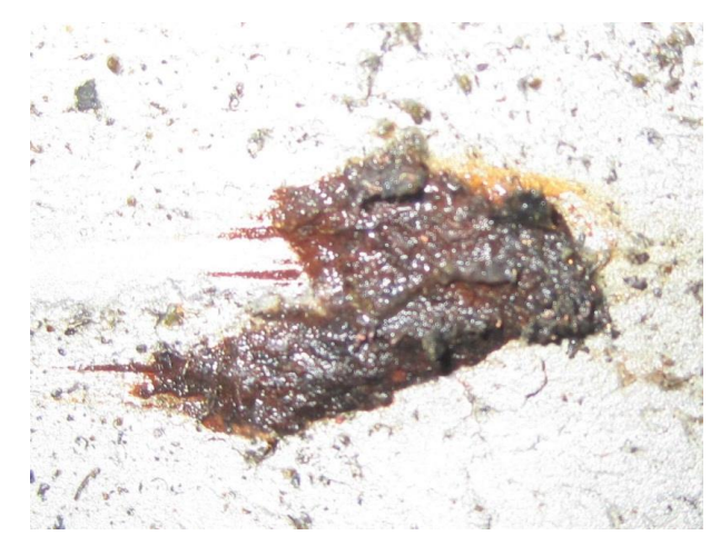
March 28, 2011