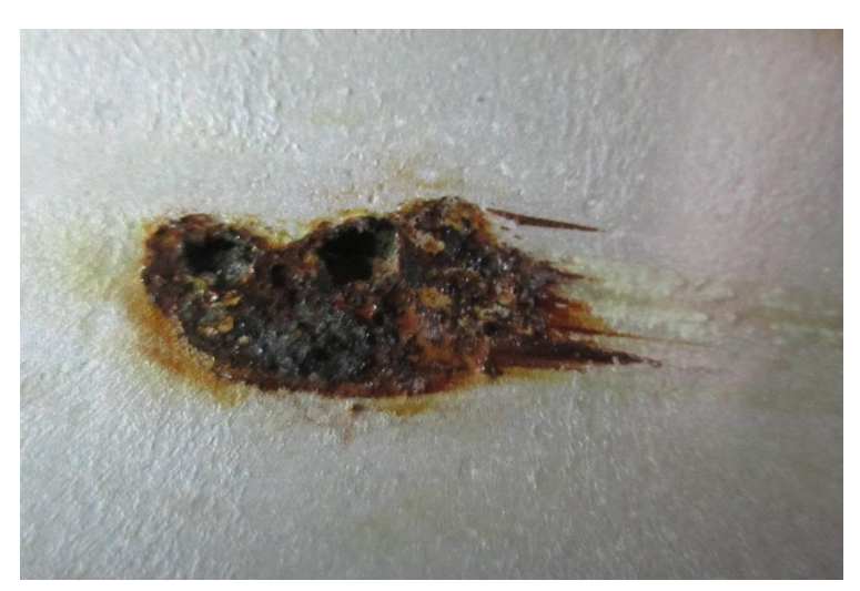
May 24, 2011