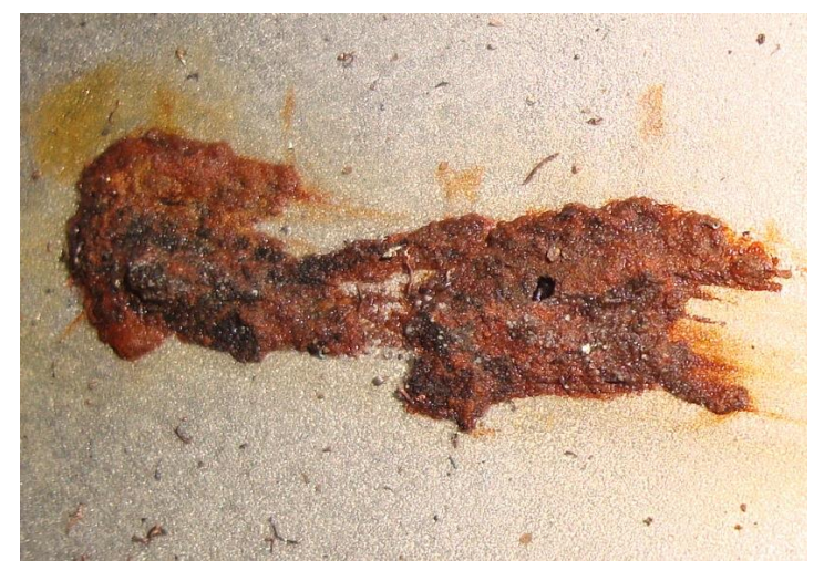
March 28, 2011