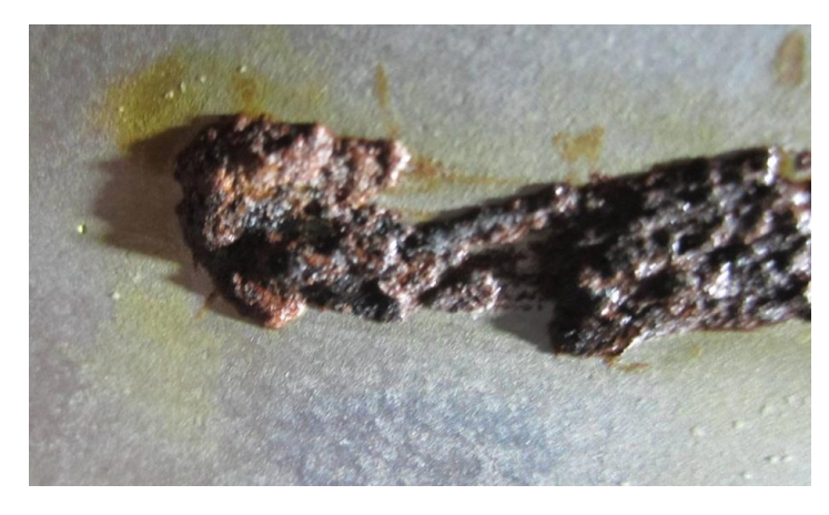
May 24, 2011