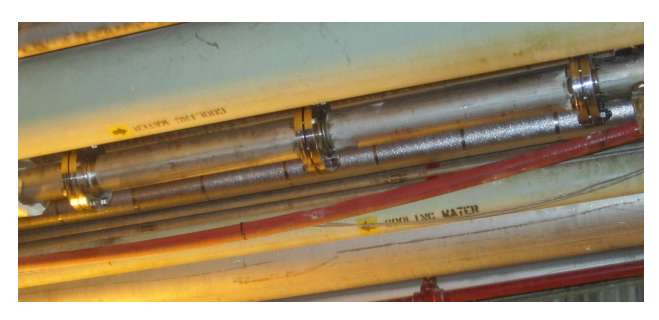
Contaminated and clean 30" [762mm] pipe spool sections

(the 120i is installed several feet [3 meters] before the pipe spool sections)