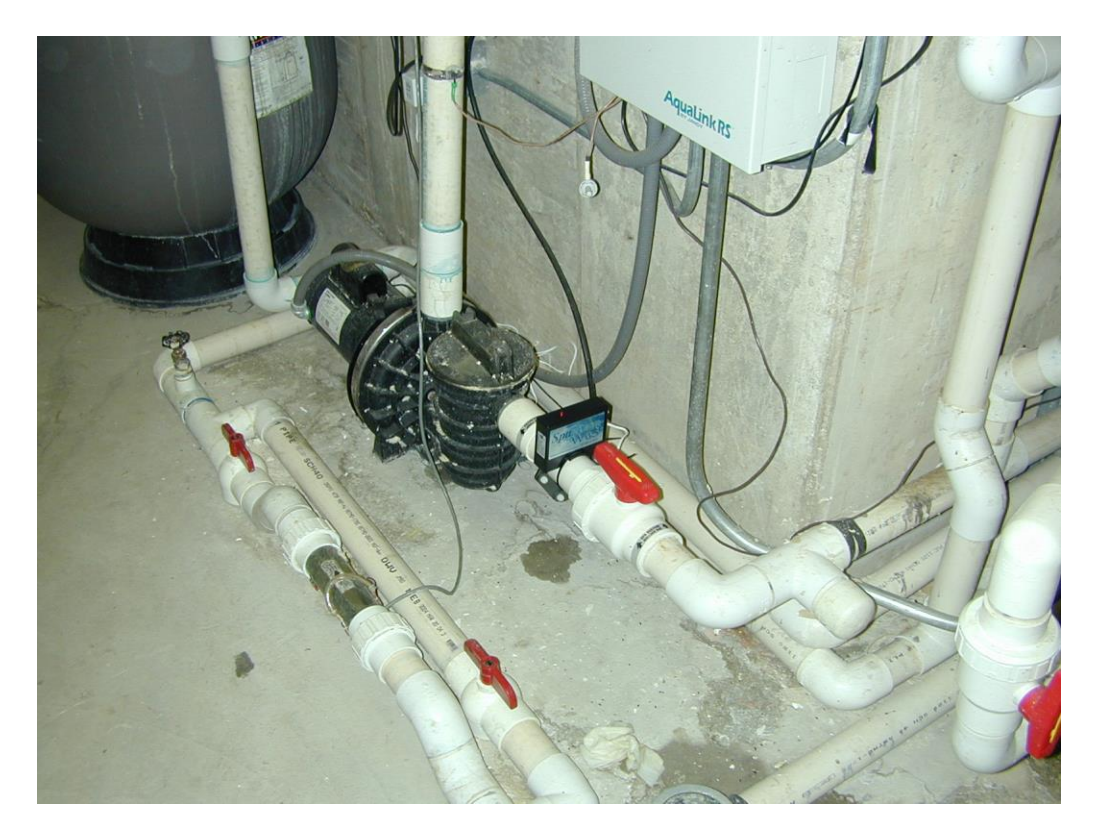
Photograph of installed HydroFLOW water conditioner